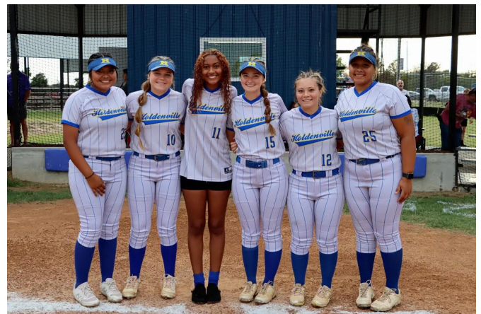
Seniors standing at home base before the game.