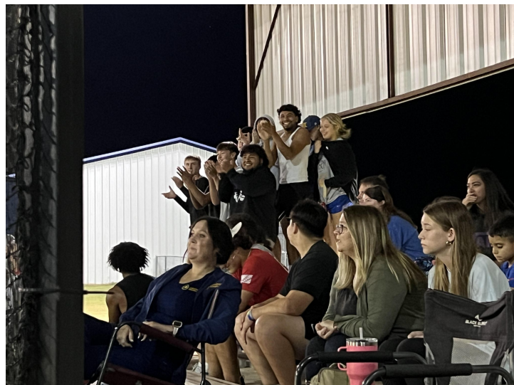
Student section cheering the Lady Wolverine Fastpitch team.

A participating student section is an asset at any game, with any sport. They fire up the athletes, and in turn, they play with more energy. Thank you, student section, for all that you do for your community. The games would not be as great without you.