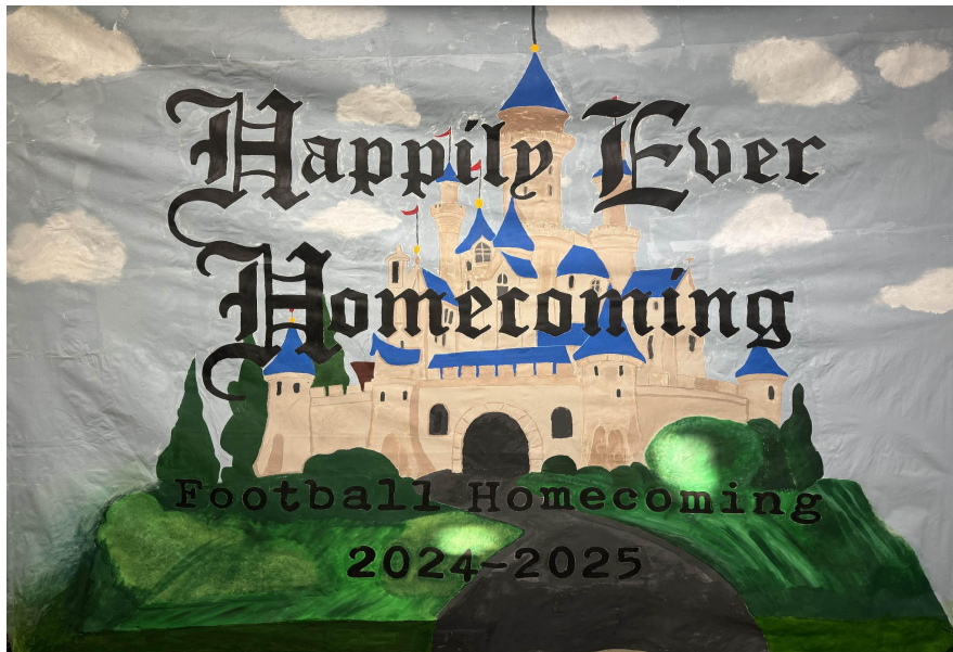
Homecoming banner 2024

No matter what these homecoming floats are a great bonding experience and an opportunity to have fun with your friends. Although some may think it is stressful it was still a great experience.