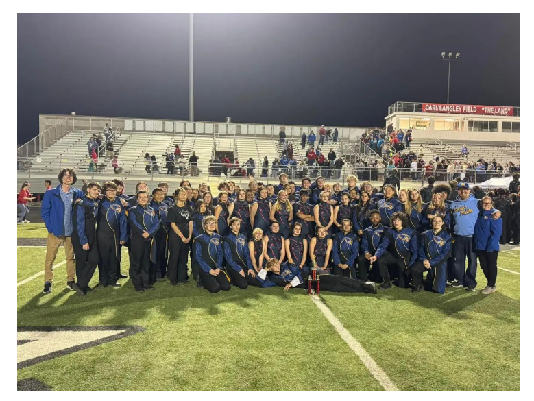
The band at the Ozark Mountain Festival

Following their incredible display at the regional band competition the group headed Branson compete at the Ozark Mountain Festival. They finished 5th overall against from Oklahoma, bands Arkansas, Missouri, and Nebraska.