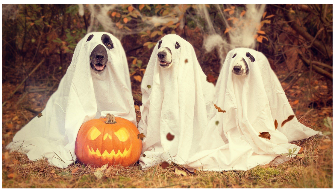
Halloween is coming.