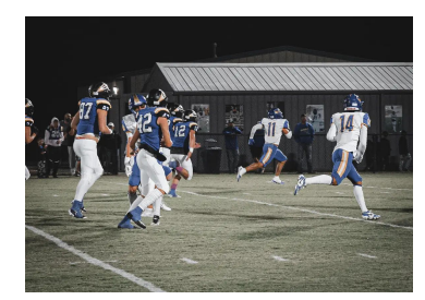
Running for the touchdown.

a Comanche team that, unless something terrible happens, the Wolverines should beat pretty easily. Then it's playoff time. If you can, please come to one of the last two home games, or even the game at Community Christian, and show your support for these guys and everything they've been able to accomplish so far this year, because it has certainly been impressive.